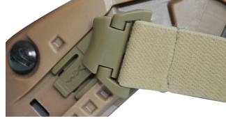
RAIL ATTACHMENT BAR