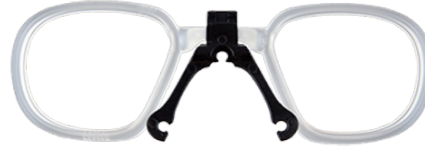
WEIGHT (WITHOUT PRESCRIPTION LENSES): 3 GRAM

Insert a prescription carrier into the goggles for corrected vision behind high impact protection.