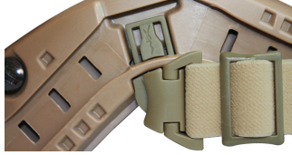
RAIL ATTACHMENT CLIP

The Rail Attachment System (RAS) makes it possible to integrate Wiley X goggles into your helmet rail system. The RAS includes two short straps with two RAS clips and two RAS bars to give a perfect fit for most of the ARC helmet rails available on the market.